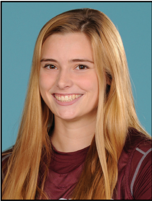
Toronto, Canada Eastern Commerce