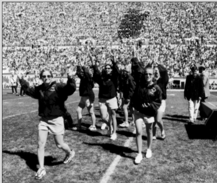
The Hokies are honored in front of more than 50,000 fans at Lane Stadium during halftime of a football game.