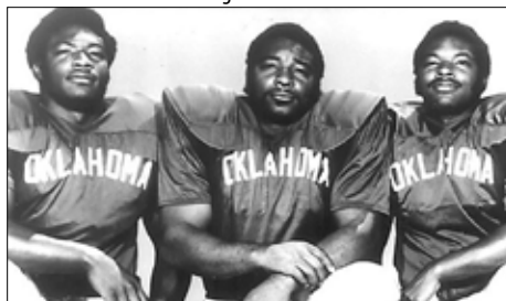
The Selmons - 1972

Just after Virginia Tech's first touchdown Monday night against Ohio State, the Edmunds brothers became just the second trio of brothers to take the field together at the same time in the same game for a major college football program dating back to 1970. The first to accomplish this rarest of feats was the Selmon brothers at Oklahoma when Lee Roy, Lucious and Dewey all played for the Sooners' defense during the 1972 and 1973 seasons.