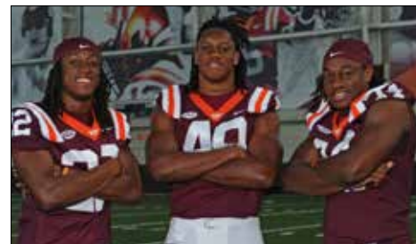
The Edmunds - 2015