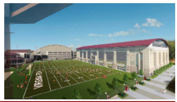
VIRGINIA TECH FOOTBALL GAME NOTES

The facility will benefit an array of sports, as athletics department officials wanted an indoor facility for sports like baseball, softball, lacrosse and both soccer teams to use during inclement weather, particularly in early spring. The price tag for project figures to run around $21.3 million.