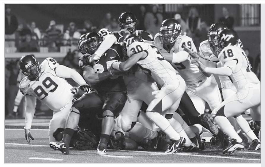
The Tech defense handled eventual ACC champion Wake Forest in a 27-6 victory over the No. 14 Demon Deacons and went on to lead the nation in total defense, scoring defense and pass defense.