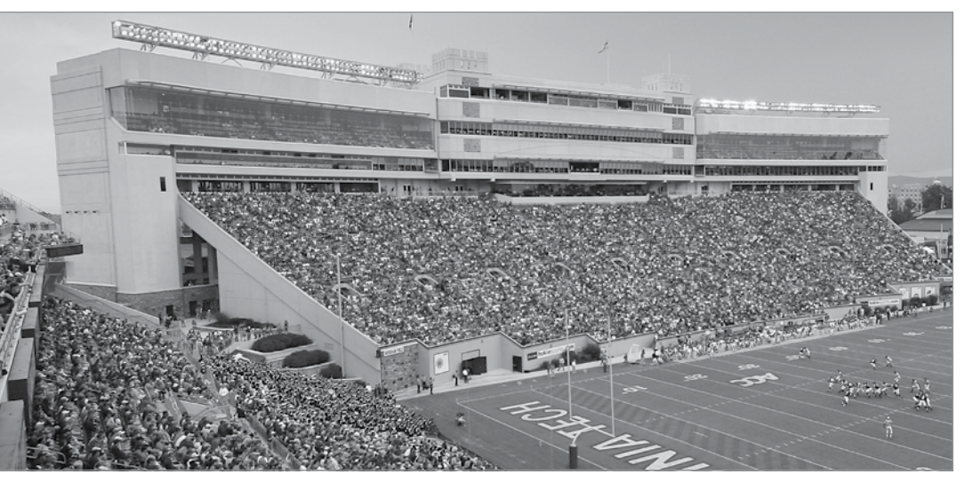
The new west side expansion is an imposing facility and provides outstanding areas for patrons and the media.

With all of these additions and improvements, Lane Stadium has kept up its reputation as one of the best places for college football.