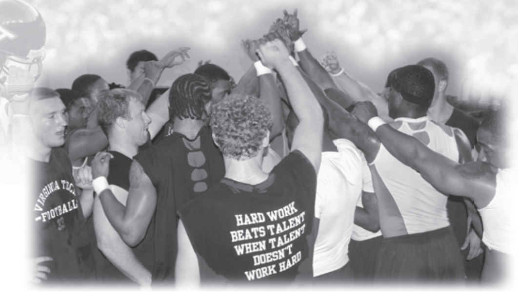
Hard work is the key for the Hokies, whether it is on the field, or in their strength and conditioning workouts.