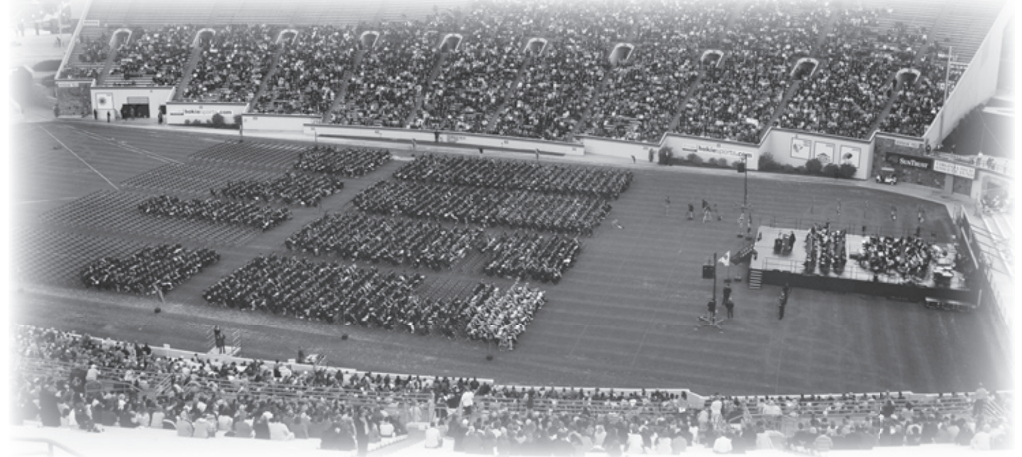
Lane Stadium is the site of many exciting moments in most Virginia Tech football players' careers, including graduation ceremonies.

The Virginia Tech Student Athlete Academic Support Services office is committed to providing