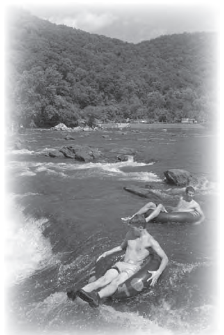
Blacksburg is surrounded by impressive natural beauty.

Blacksburg's location (adjacent to major interstate highways) provides convenient access to most points in the southern and eastern parts of the country.