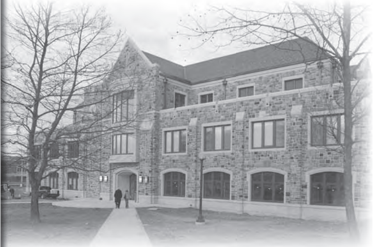
The Student Services Building