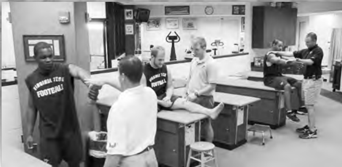
Tech's Eddie Ferrell Memorial Training Room and medical facilities are second to none.