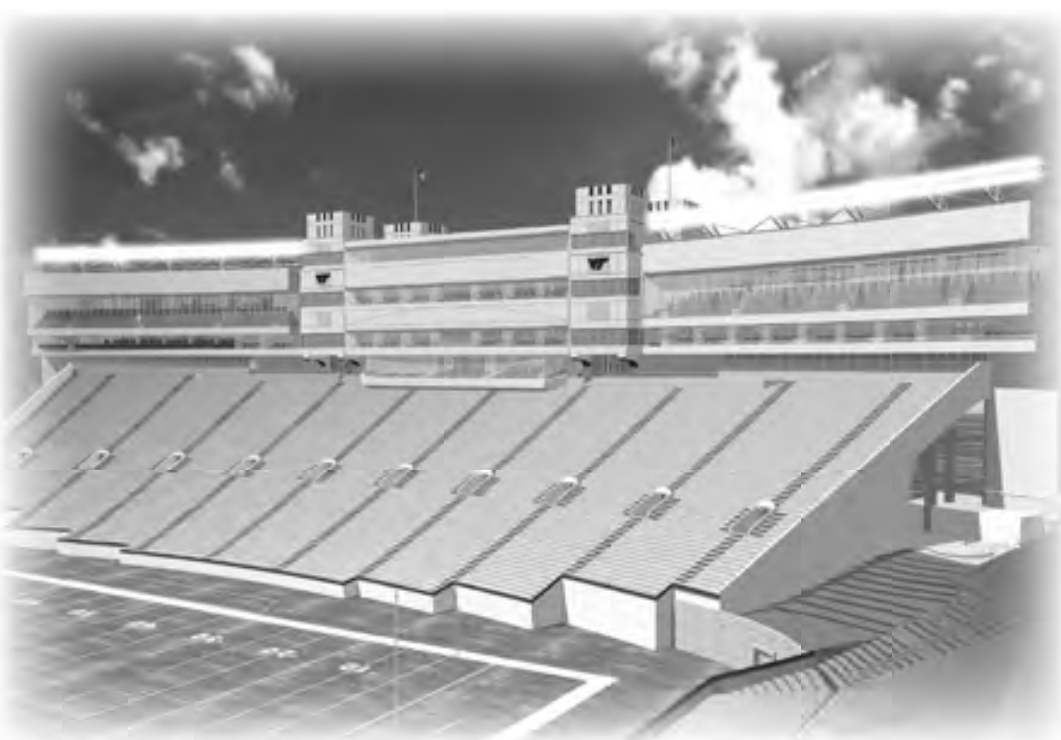
An artist's rendition of the new west side expansion shows the scope of the project that will replace the old press box visible in the picture at the top of the page.

Ground was broken in November of 2004 for the latest project and crews began building around the current press box, laying the above and below