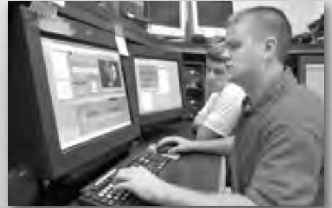
Tech's videography department utilizes state-of-the-art equipment.