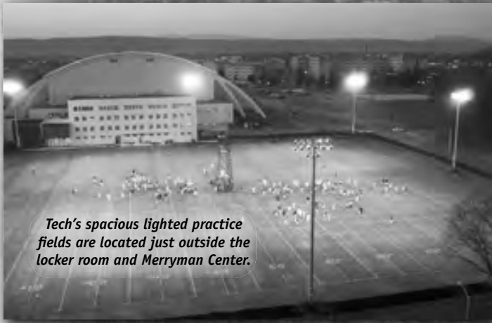
Tech's spacious lighted practice fields are located just outside the locker room and Merryman Center.