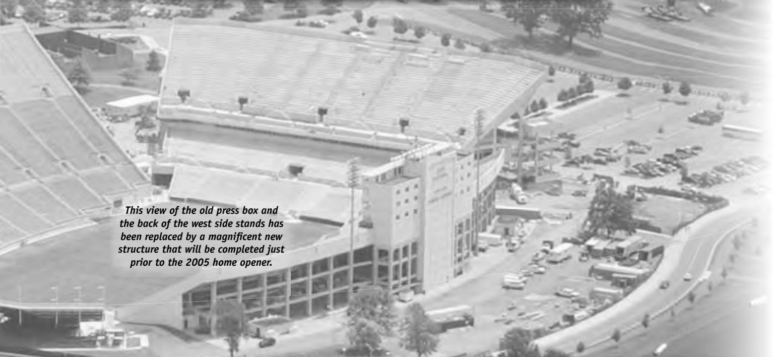
This view of the old press box and the back of the west side stands has been replaced by a magnificent new structure that will be completed just prior to the 2005 home opener.