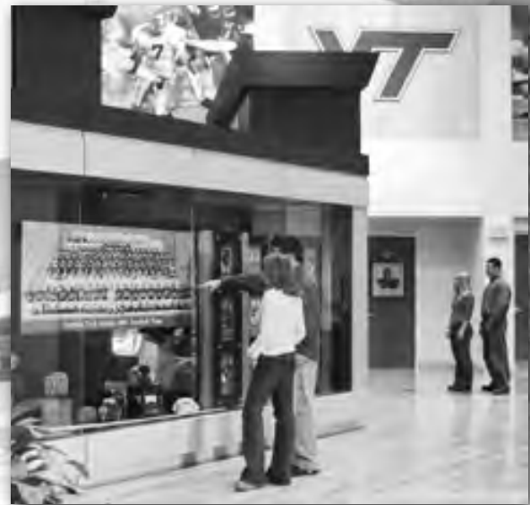
The Hall of Legends in the Merryman Center serves as a grand entrance to the athletics department.