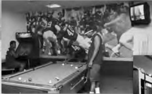
The Hokies enjoy a spacious and well-equipped locker room and adjacent players' lounge.