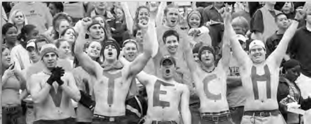
66,233-seat Lane Stadium is an imposing venue that really comes alive on game days.