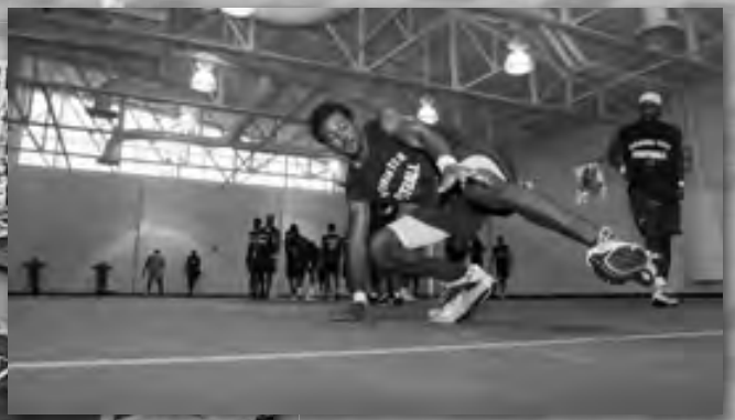
The Hokies train in the spacious Merryman Center weight room and the adjacent speed and agility room.