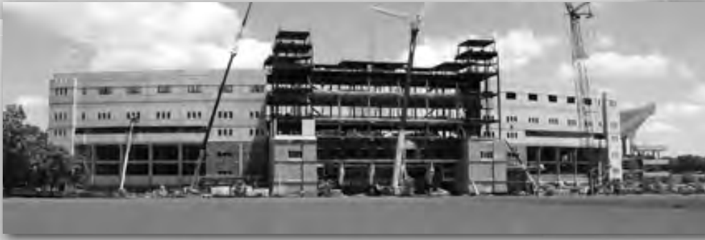
Student Athlete Academic Support Services will move into a spectacular area in the new west side addition to Lane Stadium following the 2005 football season.