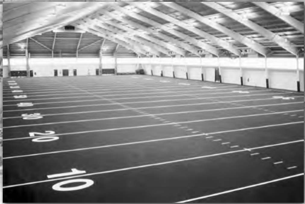
The Hokies have a full-sized indoor practice facility in Rector Field House.